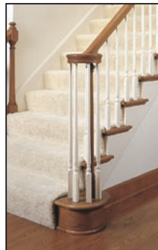
Over-the-Post in which a continuous rail is placed on top of the newel posts.