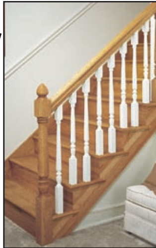
Open Stairway An open stairway has the treads and risers exposed for the side view.

The stair body consists of parts called treads, risers and stringers. There are two ways to combine these parts — as an open or a closed stairway.