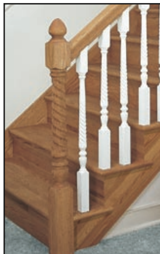
Post-to-Post in which the rail is cut and fitted between the newel posts.

The balustrade system consists of newel posts, balusters and rails. The handrails are fitted to the newel posts in two basic ways: