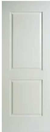
2 Panel Smooth