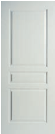
3 Panel Textured