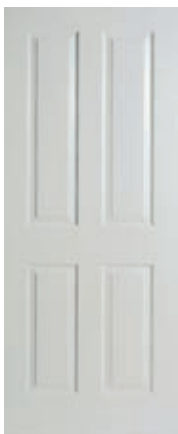
4 Panel Smooth & Textured