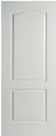
2 Panel Arch Top Smooth & Textured