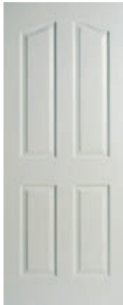
4 Panel Arch Top