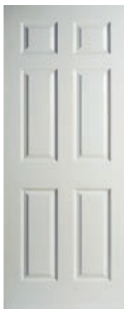
6 Panel Smooth & Textured